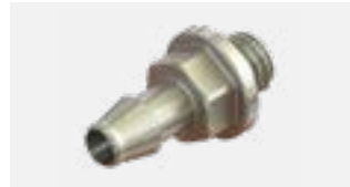
Barb to Thread