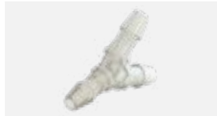
Barb to Barb