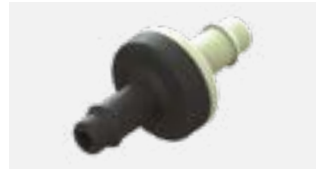
Diaphragm & Floating Disc