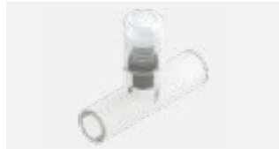
Pressure Relief Valves